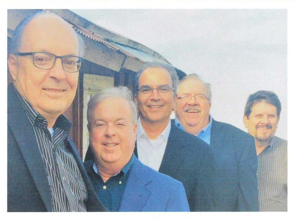
A benefit concert for Saint Paul Lutheran's 125th Anniversary. Featuring Root Beer Floats and a silent auction!