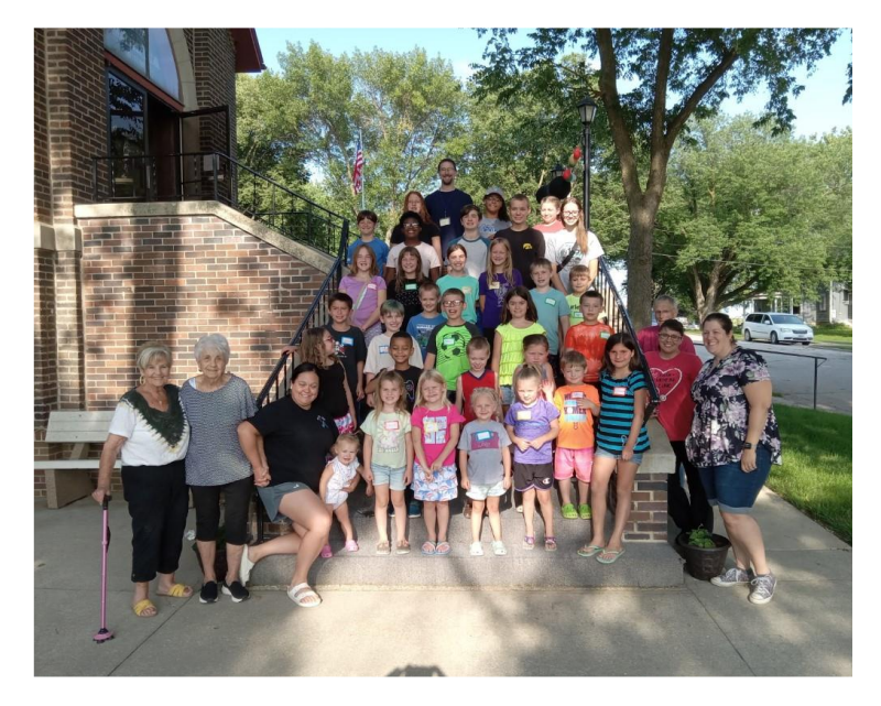
Thank you to all the volunteers that helped make this week a success

Vacation Bible School was July 16-19. The theme for this year was "God's Living Water" Each night they started with a meal and then had activities including: lessons, singing, craft & games. Their donations for the week want to the 125<sup>th</sup> Penny Fund. On the last night we had a closing program and potluck at the park. The kids shared what they learned during the week by singing some of the songs.